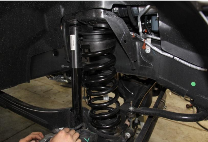
Image below of spacer installed

10. Take vehicle directly to a shop to get an alignment